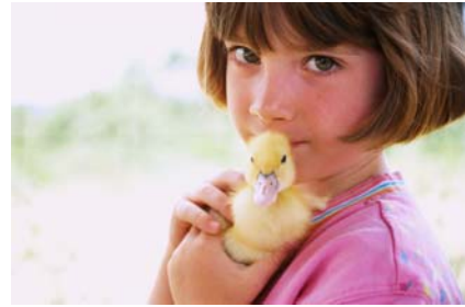
Ducklings prefer to eat from pie tin feeders.